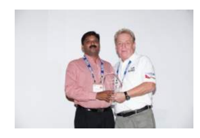
Sevenseas awarded the "Most valuable agent India sub continent" in the GLN meet during the year 2010

Sevenseas has won Awards at all the Network meetings that we have been part of voted by the members in the network. Sevenseas was also profiled in the Logistics magazine Cargo talk under the category growing logistics service providers in India