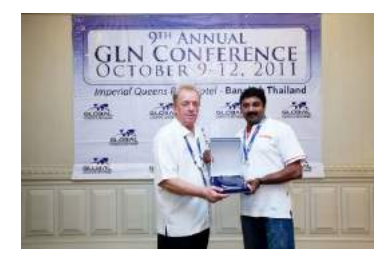
Sevenseas awarded the "Best Operations India Sub continent" in the GLN meet during the year 2011